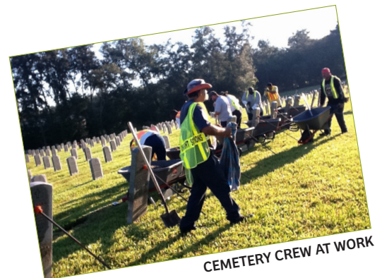
CEMETERY CREW AT WORK