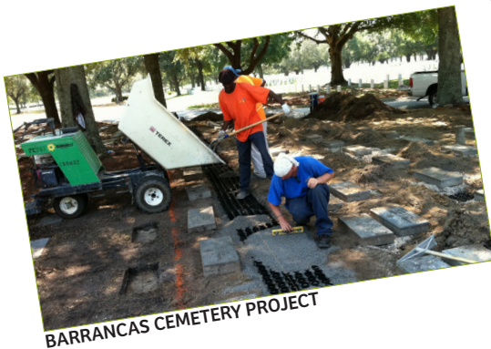
BARRANCAS CEMETERY PROJECT